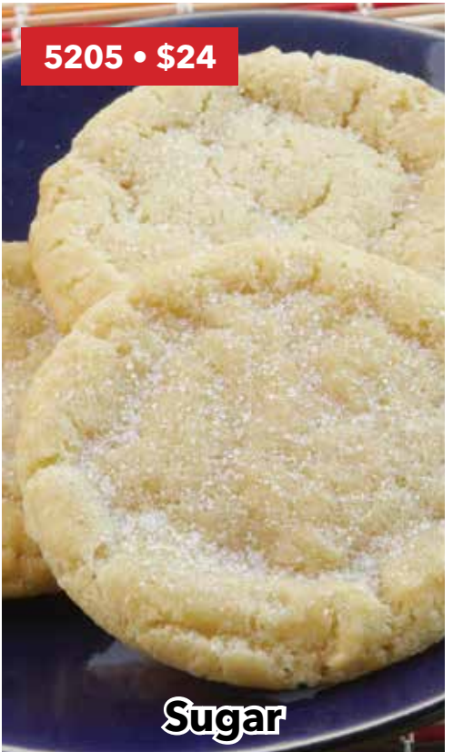
Thank You for supporting our fundraiser!